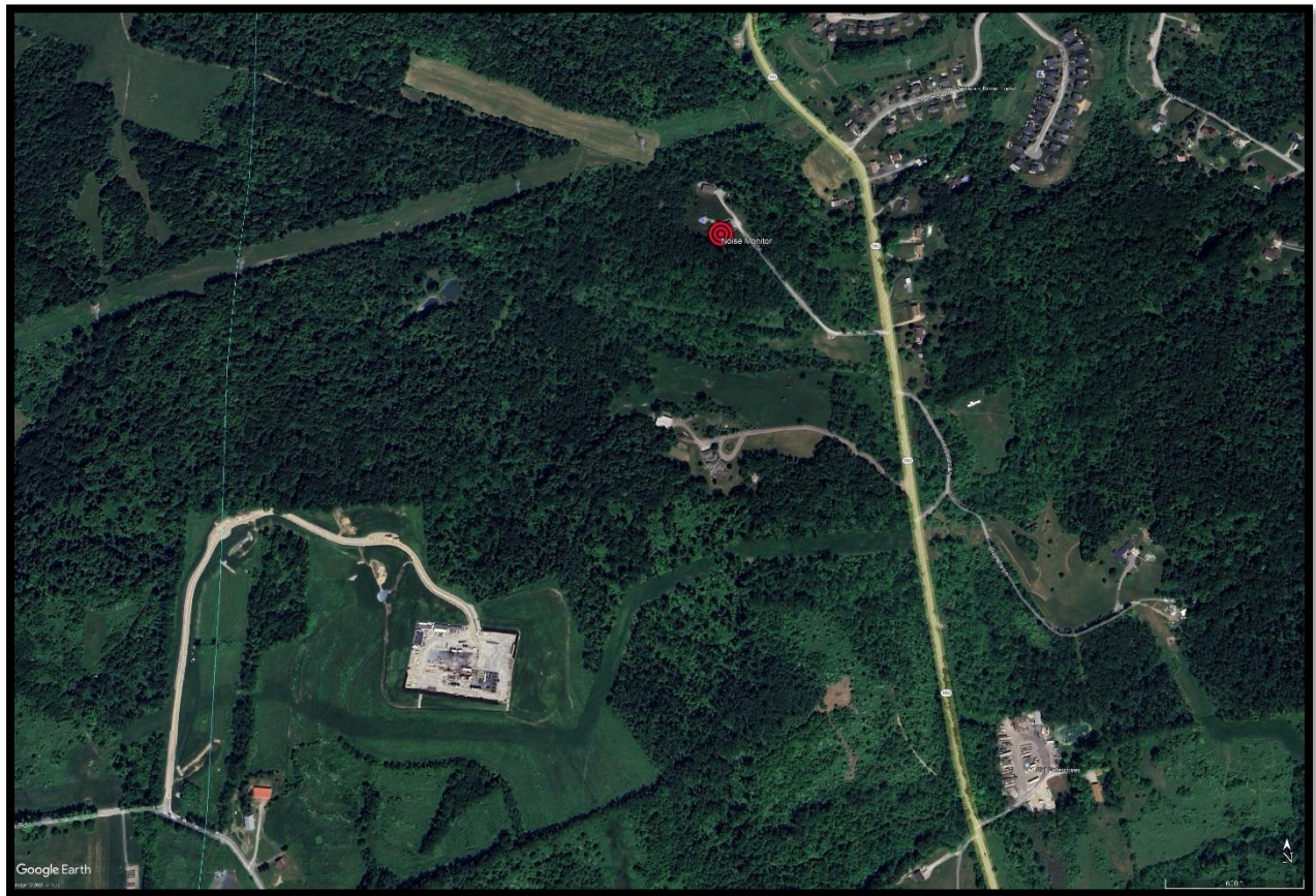
Figure 1 Bernard Schultz well site and noise monitor

The monitoring sites are shown in Figures 1 and 2.